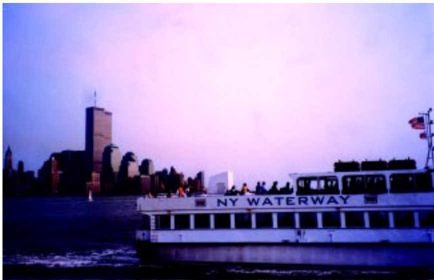
Forty-five days before the terrorist attack, home-bound commuters from the World Trade Center district rush off the ferry at Hoboken Terminal.